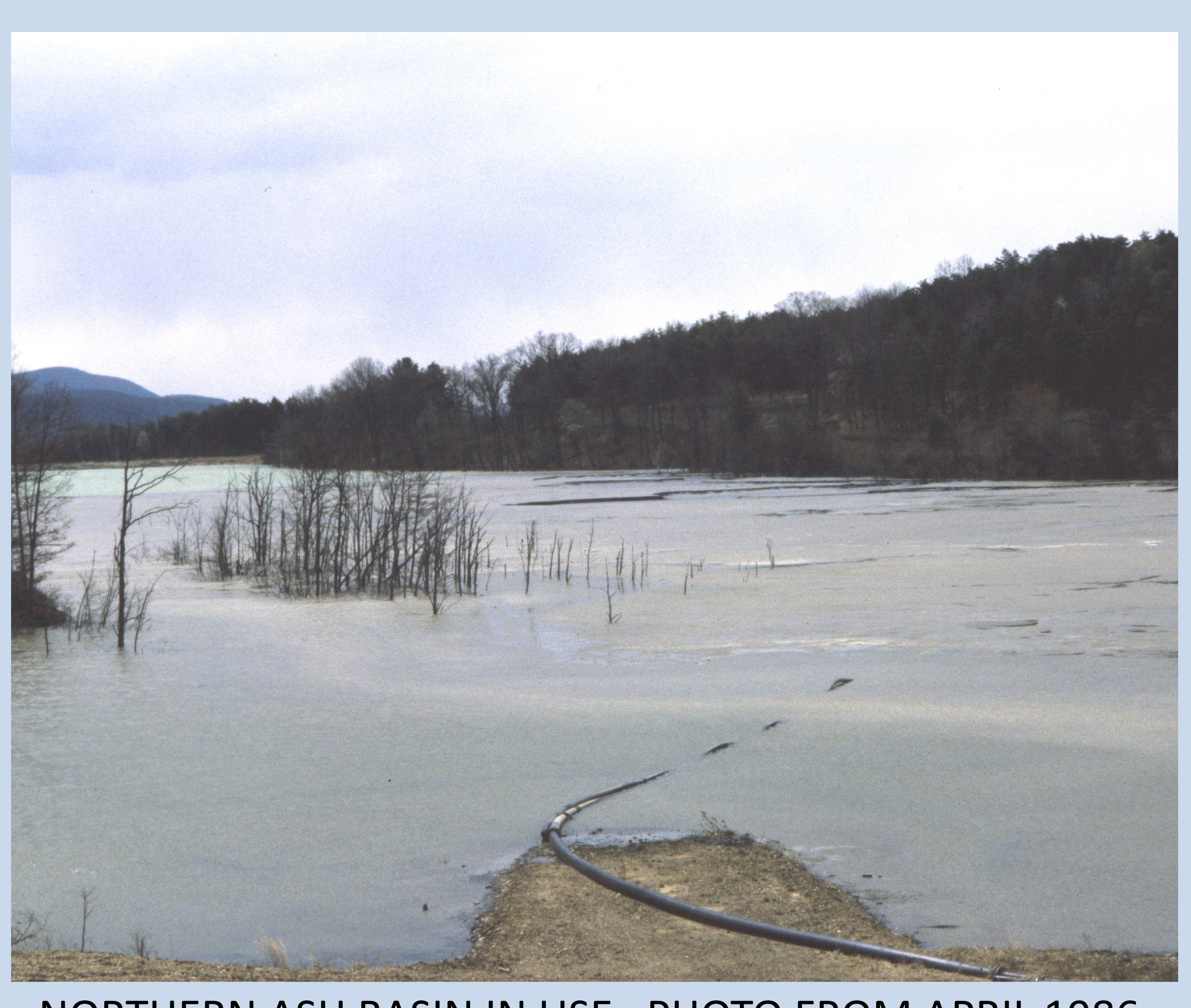
NORTHERN ASH BASIN IN USE. PHOTO FROM APRIL 1986.