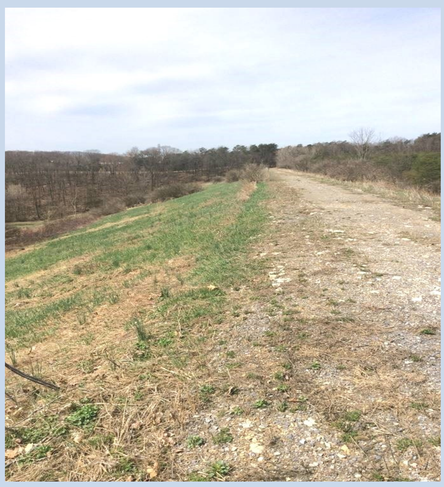
NORTHERN ASH BASIN DAM